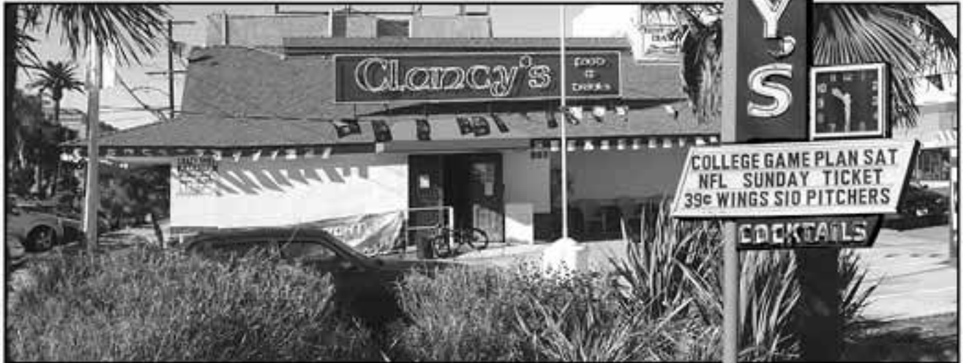
Clancy's, a long time Long Beach landmark here in the East Village on the corner of Broadway and Alamitos gets new life, again!

The Clancy's sign that has graced the corner of Alamitos and Broadway for years.