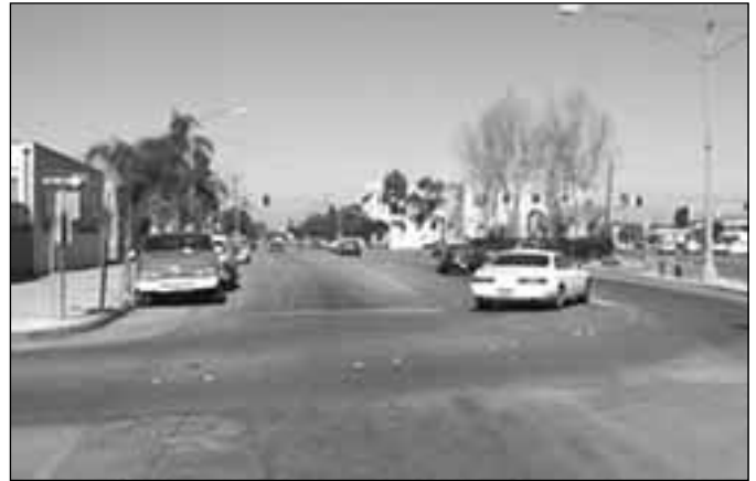
This recent photo of Martin Luther King Boulevard between 6th and 7th streets, is the proposed site of a new neighborhood park.

Rita Hooker from Nuisance Abatement explained the goals of her department: 1) to put one in touch with the right department, 2) to initiate procedure to resolve problems 3) to work responsible parties to resolve problems and 4) to begin possible legal action which may add up to a $5,000 penalty, if party does not work to resolve problems. All three of the law enforcement